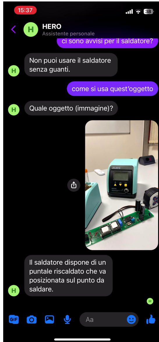
Figure 4: The figure shows a conversation with HERO using a chat where text signal have been retrieved by a speech to text module. Note that to disambiguate the worker’s question, an image has been sent to the artificial assistant representing the object for which support has been asked.

This manuscript presented technologies developed by NEXT VISION - Spin-off of the University of Catania.